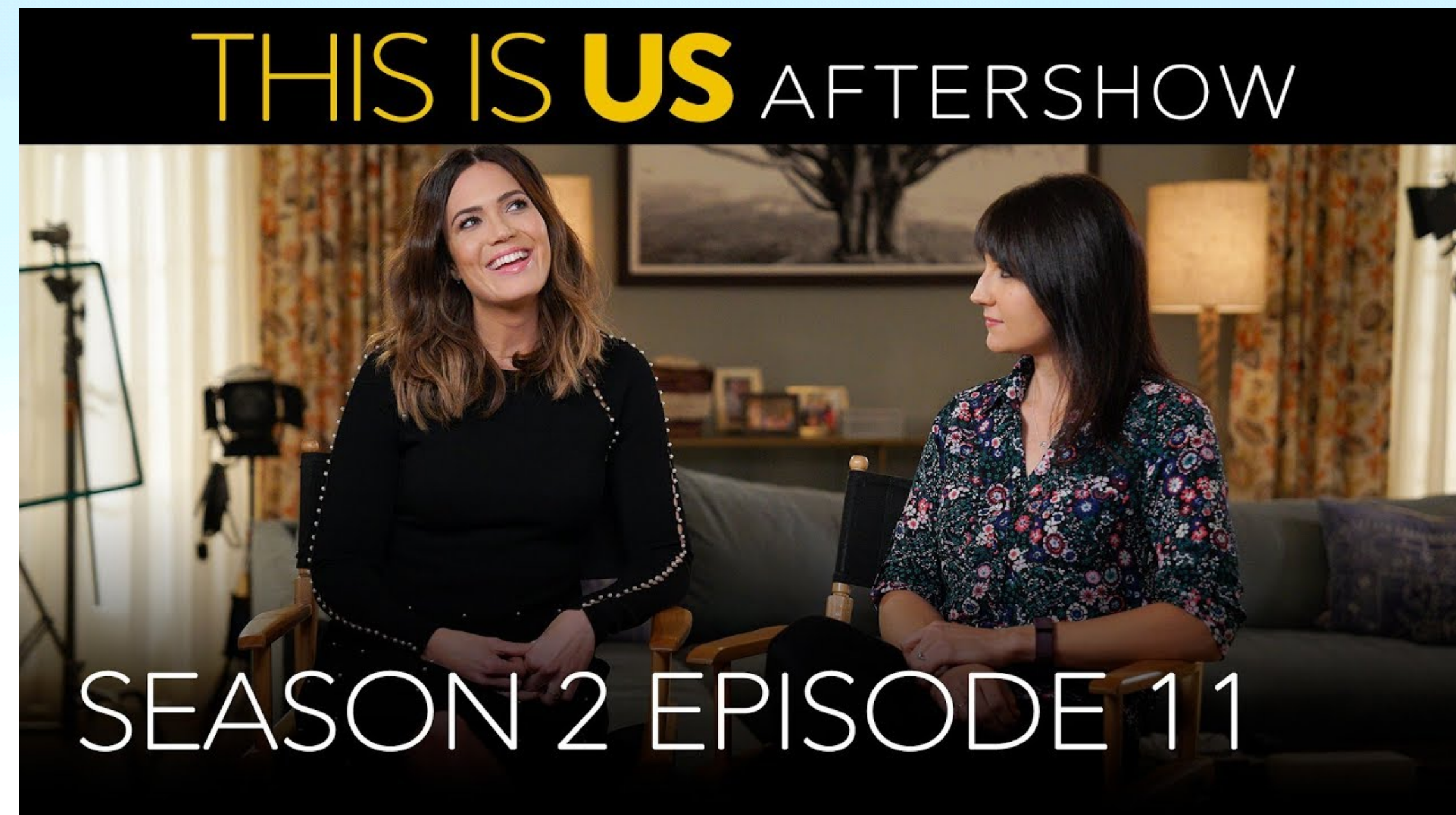
This Is Us - Aftershow: Season 2 Episode 11